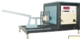
Withdrawal Pull Test Set for electrical accessories