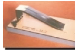
Rolling Ball tack Tester Pressure Sensitive Tapes adhesive test