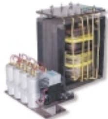
Control Gear for Special Purpose Lamps