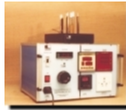
Electric Iron test for multiple tests on irons