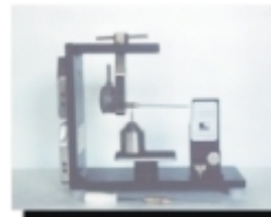
Plug Pin Deflection Test Set to test moulded mains plugs