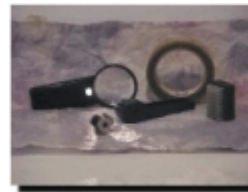
Multiple Cutting Tool to test PTFE coating on Elec. Irons