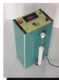
Lacquer Porosity Tester to test coating on Al. collapsible tubes