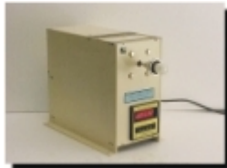
Torsion Test Set for lamp base caps