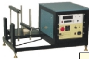
Torsion Test Set for electrical accessories and appliances